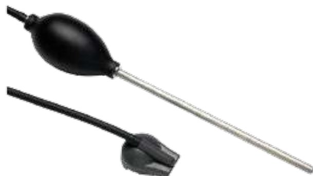
CO-205 Aspirator Kit for flue gas sampling using Fluke family of gas measuring devices.

Visit www.fluke.com to get complete details on these products or ask your local Fluke sales representative.