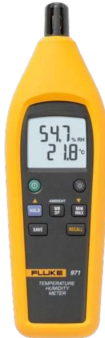
Fluke 971 Temperature Humidity Meter takes accurate humidity and temperature readings in the air for maintaining optimal comfort levels and good indoor air quality for facility maintenance and utility technicians, and HVAC-service contractors.