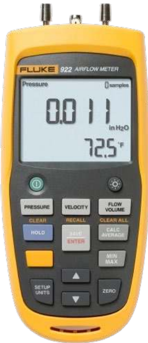
Fluke 922 Airflow Meter makes airflow measurements easy by combining differential pressure, airflow, and velocity into a single, rugged meter.