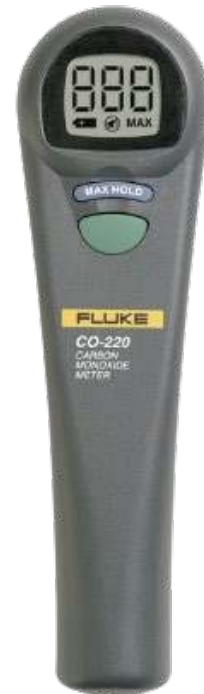
CO-220 Carbon Monoxide Meter measures CO levels in industrial environments, commercial or residential buildings where the accumulation of combustion gas is possible.